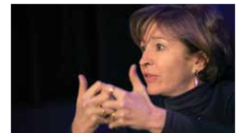
Anne-Marie Slaughter, ASIL Patron, former ASIL president and former Director of Policy Planning in the U.S. Department of State.