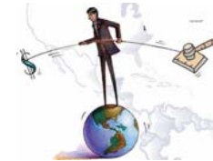
Figure 3. Applying Law and Economics to International Law is relatively new and it demands conjugating economic insights with legal arguments in a balanced fashion.

This research is the first attempt to develop a general framework to better understand the consequences of endorsing different rules in relation to the WTO legal status under domestic legal systems.