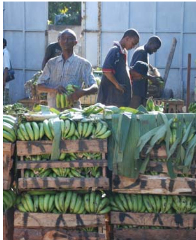
Figure 1. Bananas vendor.

The ECJ dismissed the appeal lodged by two Italian companies, FIAMM and Fedon, claiming compensation for damages suffered because of the retaliatory measures ('suspension of concessions') imposed by the US. The WTO Dispute Settlement Body (DSB) authorized the US to suspend tariffs concessions up to ca. $ 191.4 million annually as a consequence of the EC import regimes for bananas (Fig.1) from African Caribbean and Pacific (ACP) countries, which was found in violation of WTO law.